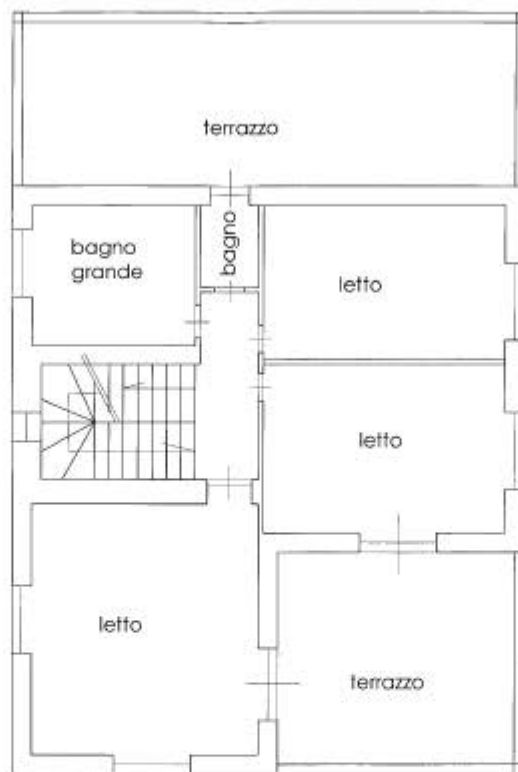
PIANO PRIMO 1:100